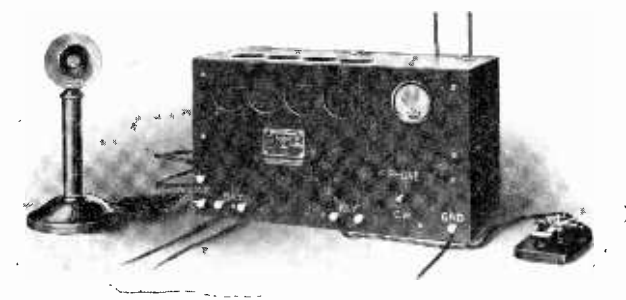
Westinghouse 20-Watt Transmitter

Here's your chance—a complete 20-watt vacuum tube radio telephone and radio telegraph Transmitter, using four 5-watt oscillating tubes, especially designed for the amateur.