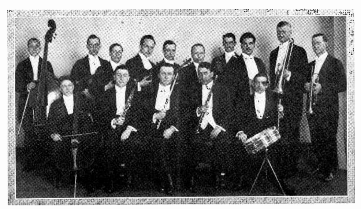
This is the first orchestra organized by a broadcasting station. It is a regular feature at Station WWJ.